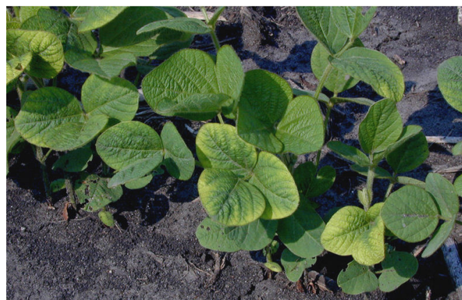
Figure 2. Potassium deficiency in soybeans. Note the yellowing pattern beginning at the leaf margins.

Symptoms of K deficiency include yellowing of the margins of the leaves, starting with the older, lower leaves (Figure 2).