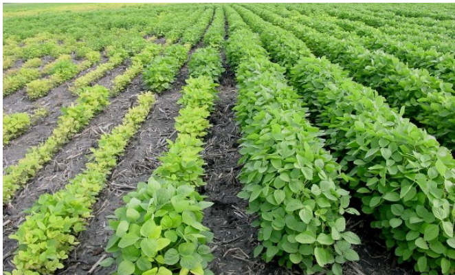
Figure 5. Pioneer research plot showing extreme varietal differences in iron deficiency chlorosis tolerance.

Increased Plant Population - Another management practice that has resulted in higher yields in IDC areas is increased plant population. Scientists suggest increasing plant density to 200,000 plants/acre in 30-inch rows in chlorotic field areas. Using GPS systems to map affected fields, and variable-rate seeding equipment to vary seeding rates in affected vs. non-affected field areas could increase the efficiency of this management strategy.