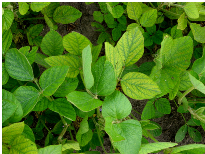
Figure 3. Manganese-deficient soybean plants. Uppermost (youngest) leaves show interveinal chlorosis while the veins remain green. Manganese is fairly immobile in the plant rendering symptoms on the newest leaves.

Manganese deficiency symptoms include interveinal chlorosis on the newest (topmost) leaves (Figure 3).