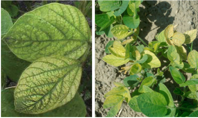
Figure 4. Interveinal chlorosis due to iron deficiency (left). Note the similar appearance to Mn deficiency (Figure 3) and stunted growth (right).

Iron Chelate Treatments - Historically, soil-applied iron chelates could not be justified due to cost, and the value of seed- and foliar-applied treatments was also questionable in Pioneer and University studies. However, a relatively new soil-applied Fe-EDDHA, Soygreen ® , is less expensive at about $10 to $15/acre. Pioneer and University studies have shown a profitable response of Soygreen, but in Pioneer studies, Soygreen did not increase yields of tolerant varieties with a rating of “7”.