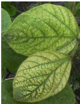
Interveinal chlorosis due to iron deficiency.

Typically, IDC symptoms begin to appear a few weeks after soybean emergence as interveinal chlorosis on the first trifoliate leaves. Because iron does not translocate in the plant, new growth will be most affected if the deficiency intensifies. Leaves may eventually turn yellow with dark green veins and the plants may be stunted. Under severe iron deficiency, plant leaf edges become necrotic (turn brown) and the necrosis may progress until entire leaves or even plants are dead. The symptoms tend to show up in irregularly shaped spots randomly distributed across a field.