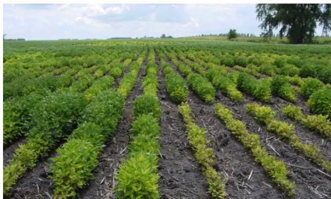
Pioneer iron deficiency chlorosis research plot.

This recent research suggests growers may have some new tools to manage iron deficiency chlorosis. Soygreen and interseeding competition crops have provided the most consistent means of improving yields in fields with a history of chlorosis. However, the first step to success involves the