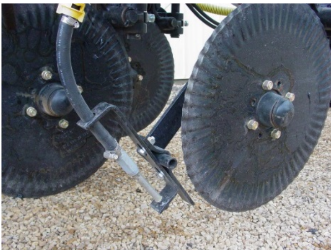
Figure 2. Row unit for banding fertilizer.