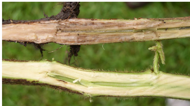
Split soybean stem on top shows stem symptoms of sudden death syndrome infection. Split stem on bottom is healthy.

appear if the soil is too dry or too wet. Splitting the root reveals that the cortical cells have turned a milky gray-brown color while the inner core, or pith, remains white. The general discoloration of the outer cortex can extend several nodes into the stem, but its pith also remains white.