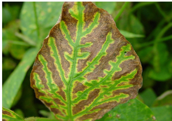
Soybean leaf showing classic symptoms of sudden death syndrome infection, with yellow and brown areas contrasted against a green midvein and green lateral veins.

SDS is caused by a virulent strain of the common soil-inhabiting fungus Fusarium virguliforme . This root-rotting organism infects soybean plants very early in the growing