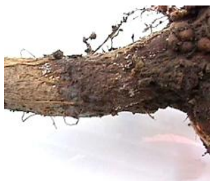
SDS-infected stem and root. Note blue mold at soil line.

SDS begins as a root disease that limits root development and deteriorates roots and nodules, resulting in reduced water and nutrient uptake by the plant. On severely infected plants, a blue coloration may be found on the outer surface of tap roots due to the large number of spores produced. However, these fungal colonies may not