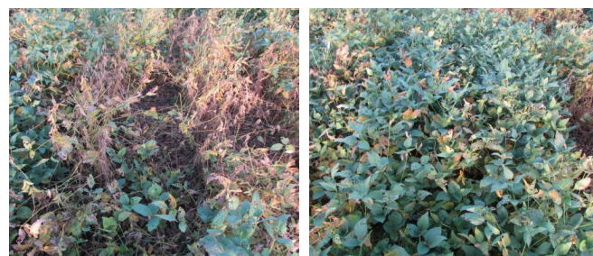
Figure 2. Soybeans treated with FST/IST (left) and FST/IST + ILeVO® fungicide (right) at a research location with SDS near Lawrence, KS, in August 2014.